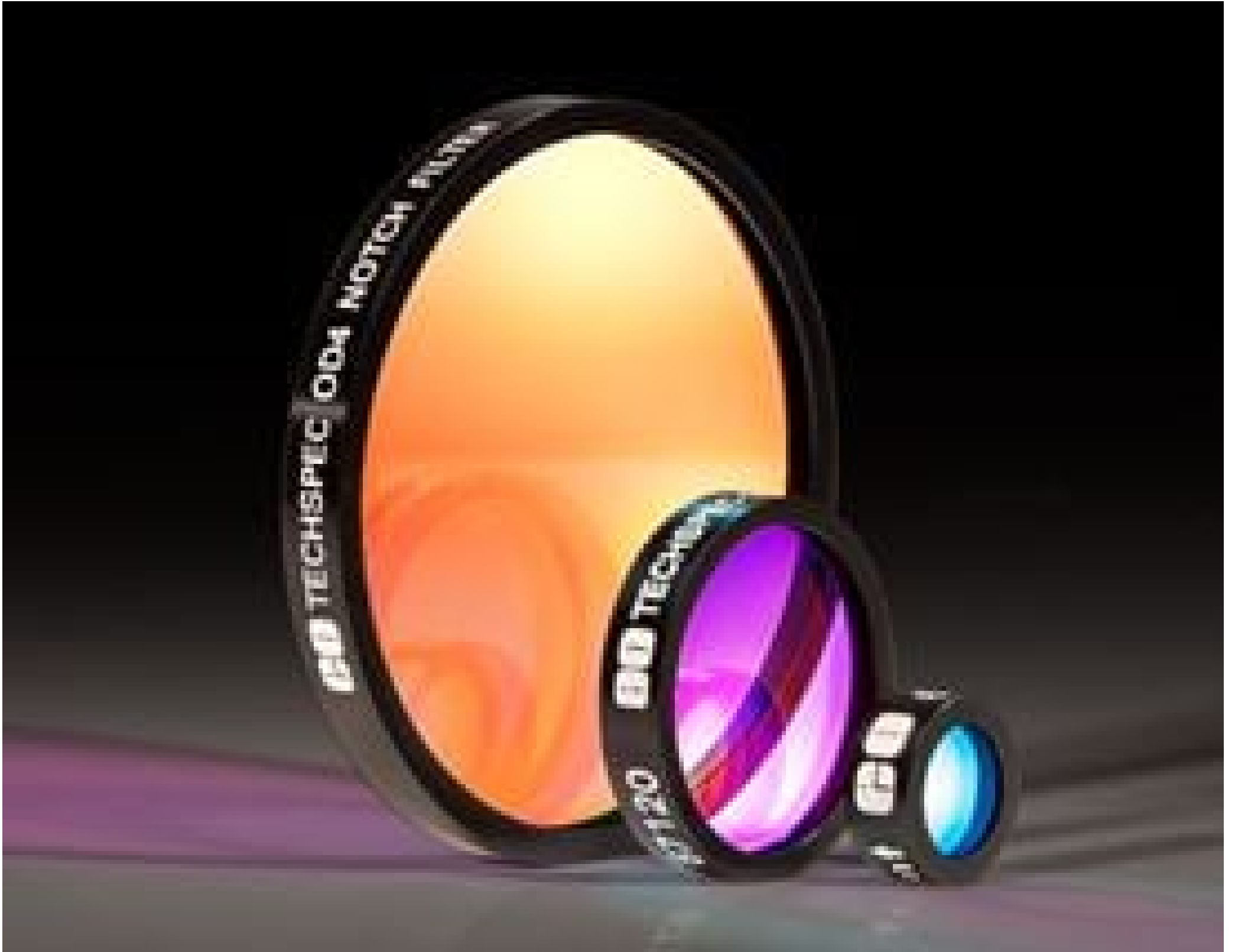
TECHSPEC OD 4.0 Notch Filters