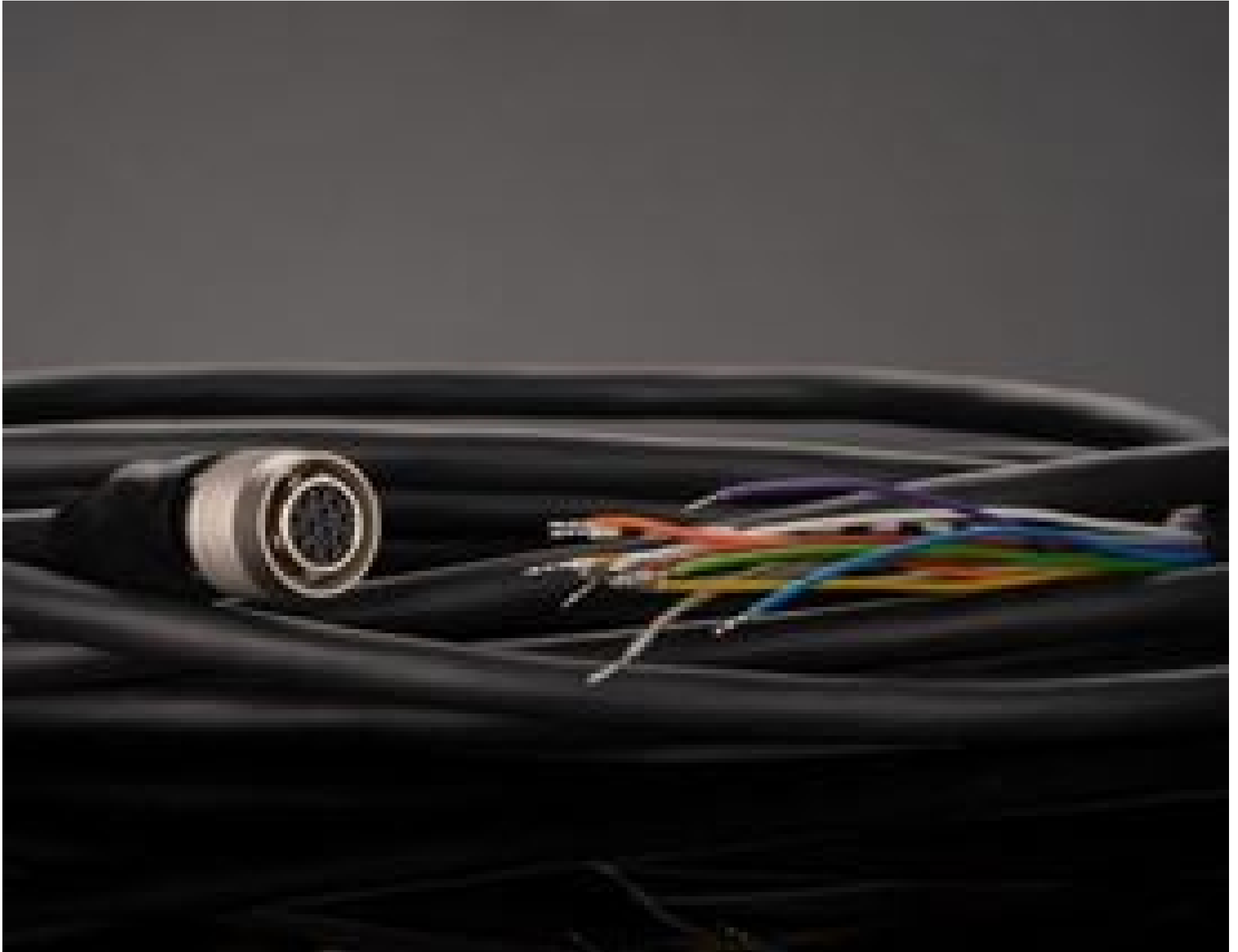
12-pin Hirose I/O Cable, 5m (#62-712)