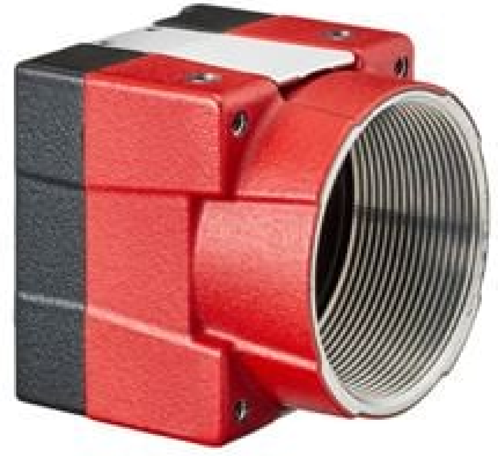
Allied Vision Alvium Camera, Full Housing (Front)