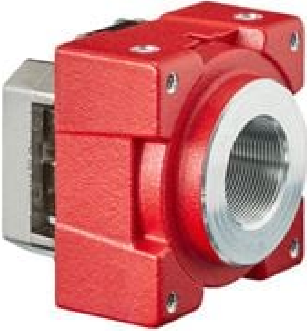
Allied Vision Alvium Camera, Partial Housing, S-Mount (Front)