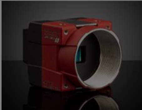
Allied Vision Alvium USB 3.0 Cameras