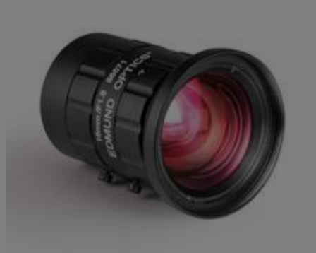
#86-571 - 16mm Focal Length, HP Series Fixed Focal Length Lens €725,00