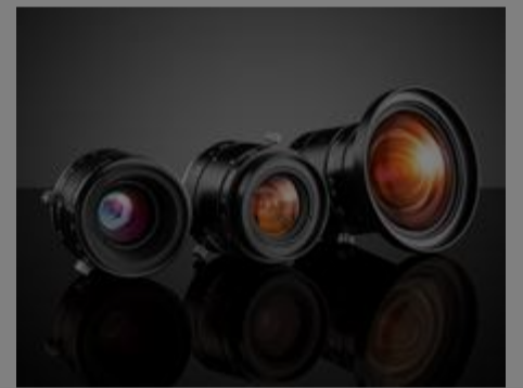
#14-113 - 25mm Focal Length Lens, 1.1" Sensor Format €1.031,00