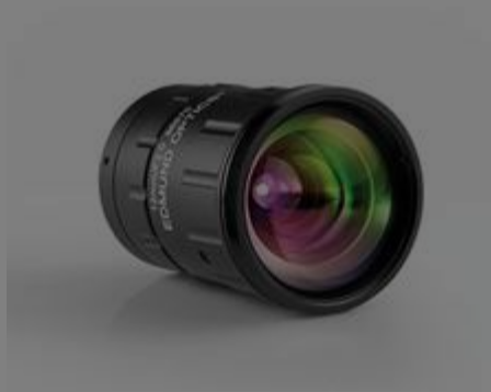
#86-570 - 12mm Focal Length, HP Series Fixed Focal Length Lens €725,00