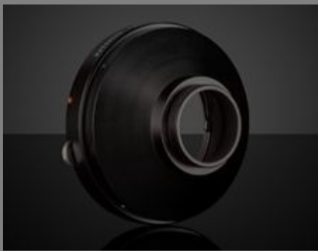
#54-341 - Nikon F-Mount Lens to C-Mount Camera Adapter €85,00