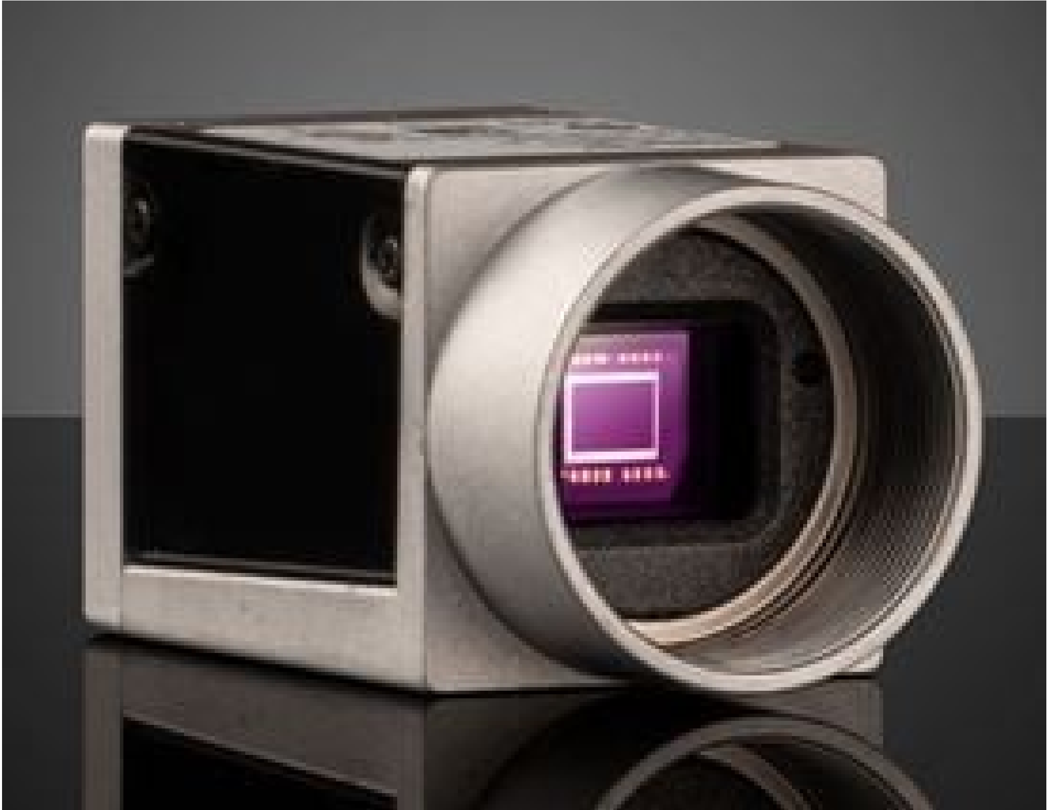
Basler ace GigE Cameras