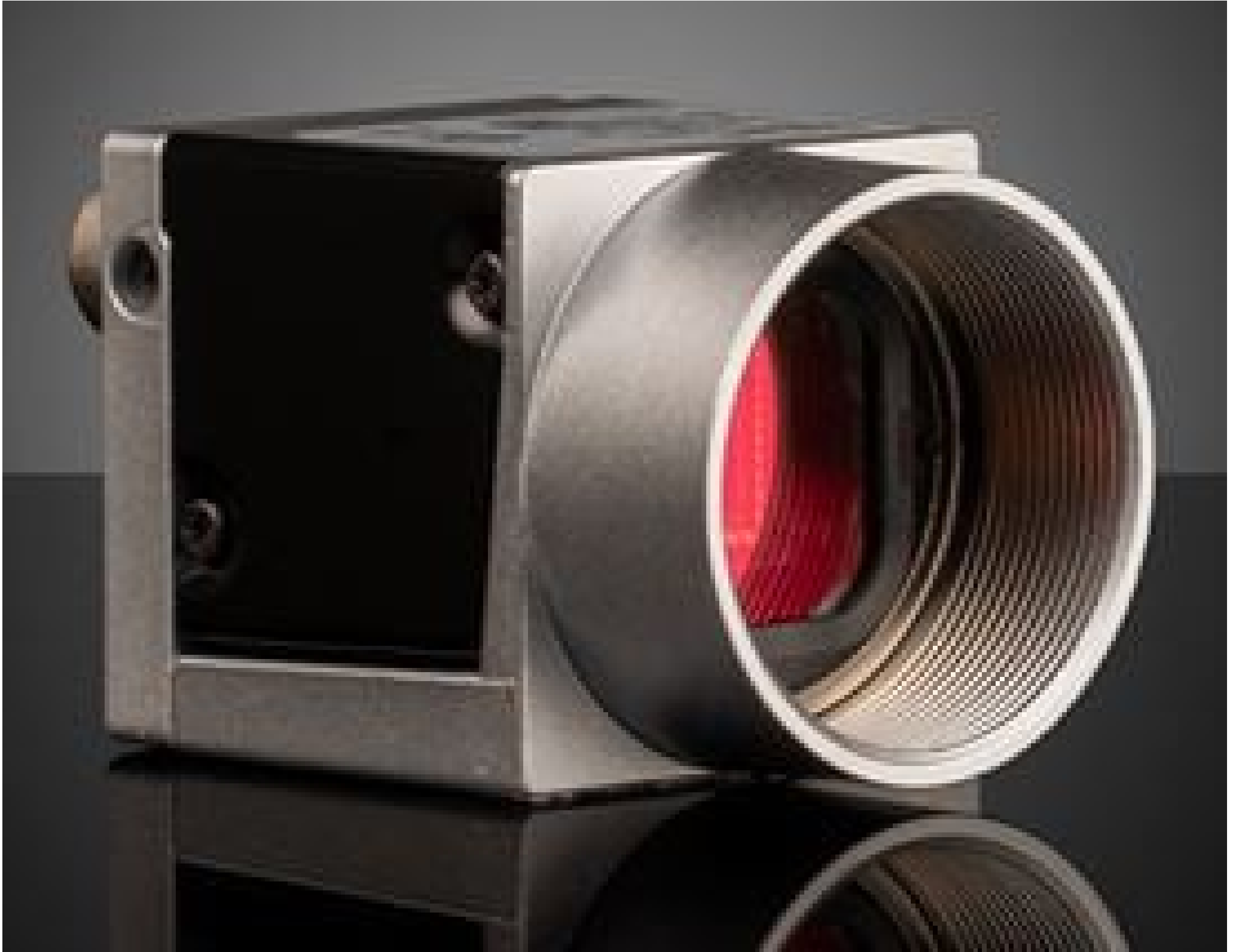
Basler ace USB 3.0 Cameras (Front)