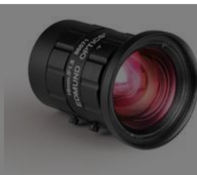
#86-571 - 16mm Focal Length, HP Series Fixed Focal Length Lens €725,00