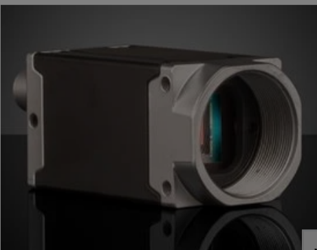
Basler ace2 GigE Cameras (Front)