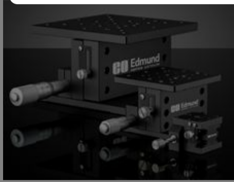
#66-509 - 125mm, Metric Z-Stage €1.090,00