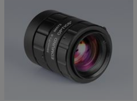
#86-573 - 35mm Focal Length, HP Series Fixed Focal Length Lens €575,00