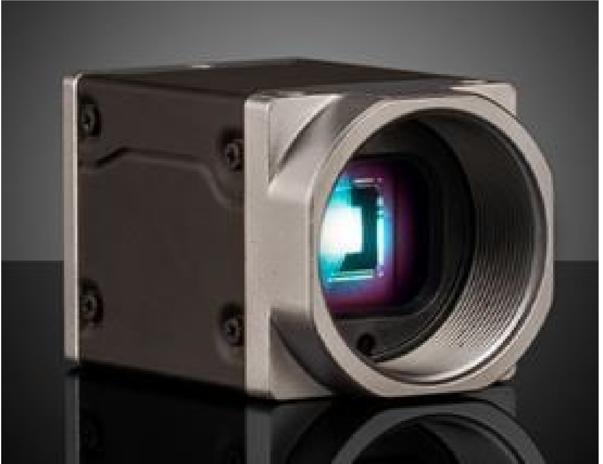
Basler ace2 USB 3.0 Cameras (Front)