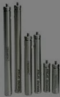
Metric Stainless Steel Mounting Posts