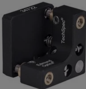
Compact Kinematic Mount, 2-Screws, #34-722

Please select your shipping country to view the most accurate inventory information, and to determine the correct Edmund Optics sales office for your order.