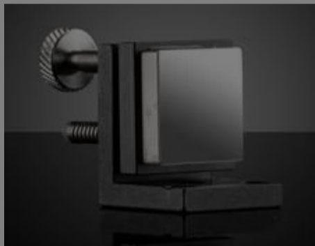
#33-504 - 1.0" Angle Mirror Mount with Mirror €133,00