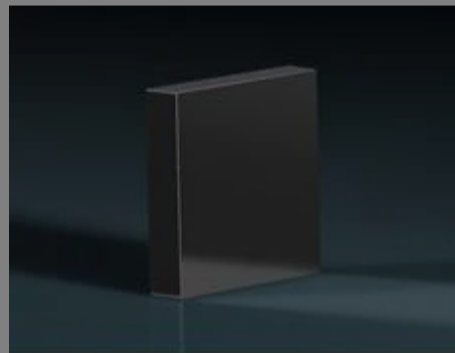
#34-387 - 10 x 10mm Protected Silver, \lambda/20 Mirror €166,00