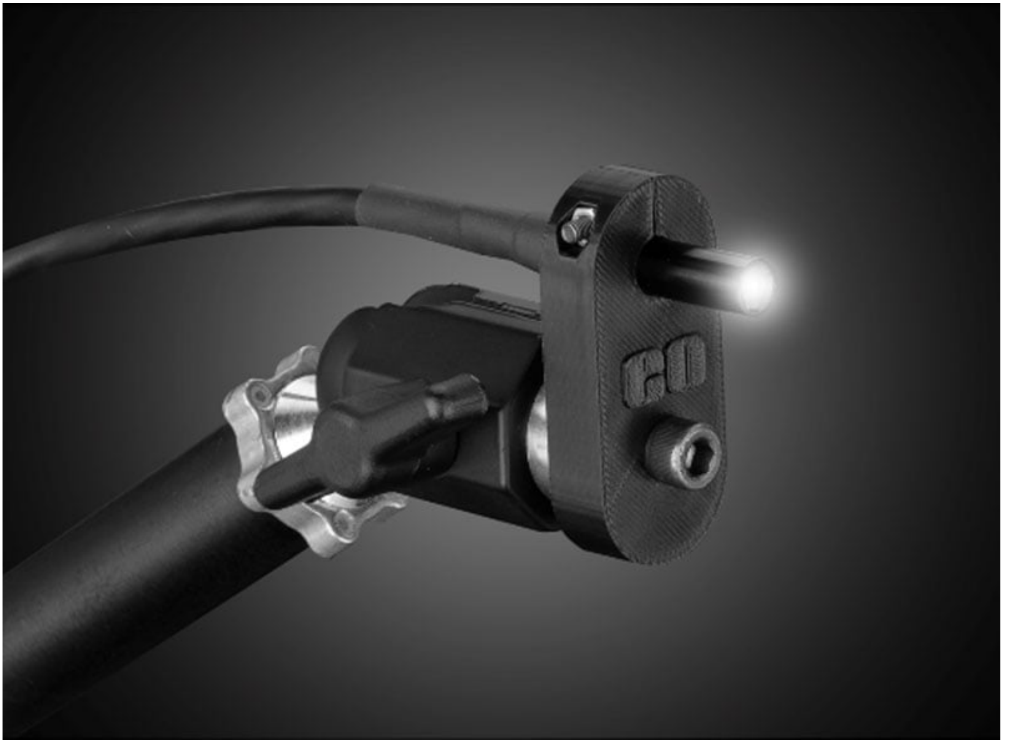
Spot Light Configuration