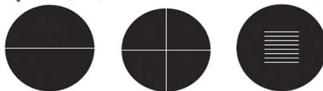
7 x 7 Grid Reticle (#88-521) Edge Reticle (#88-522)