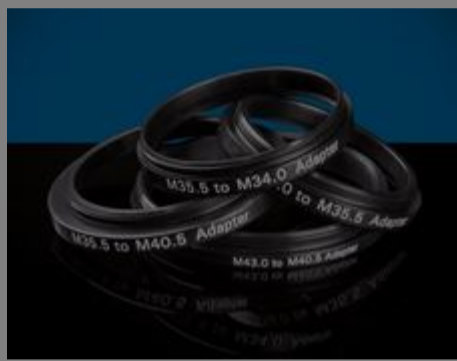
Machine Vision Filter Adapters