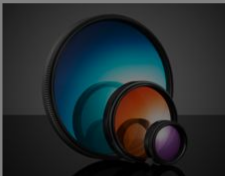
#21-663 - IR M40.5 x 0.50 Mounted Machine Vision Filter €195,00