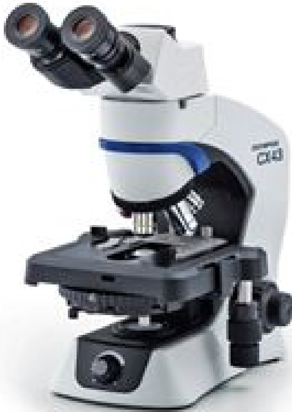
Image shown is full assembly. Each component sold separately. See Technical Information tab for additional details.