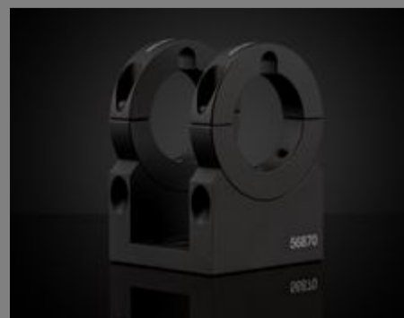
#56-870 - Mounting Clamp, 1.75" Centerline, 30mm ID