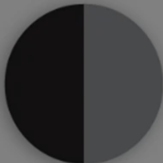
#88-522: Edge Reticle for Pattern Projectors