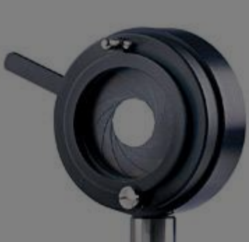
#37-919 - Mounted 48.0mm Iris Diaphragm