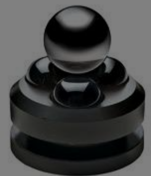
#59-495 - CaliBall Interferometer Calibration Device