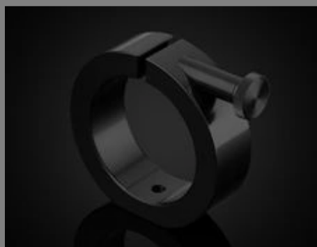
#52-930 - 30mm, C-Mount Ring Mount, 1/4-20 Tapped Hole