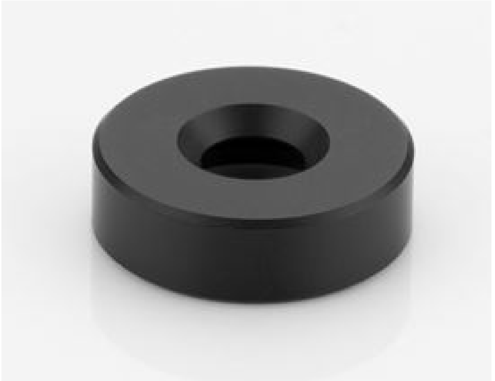
Filter Holder for 50mm Cx Lens (representative photo). Filter Holder varies by stock number. View PDF drawing for additional information.