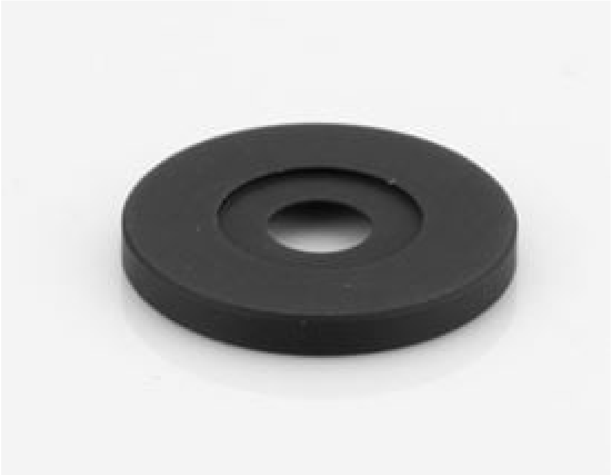
Aperture for Cx Lens (representative photo). Aperture varies by stock number. View PDF drawing for additional information.