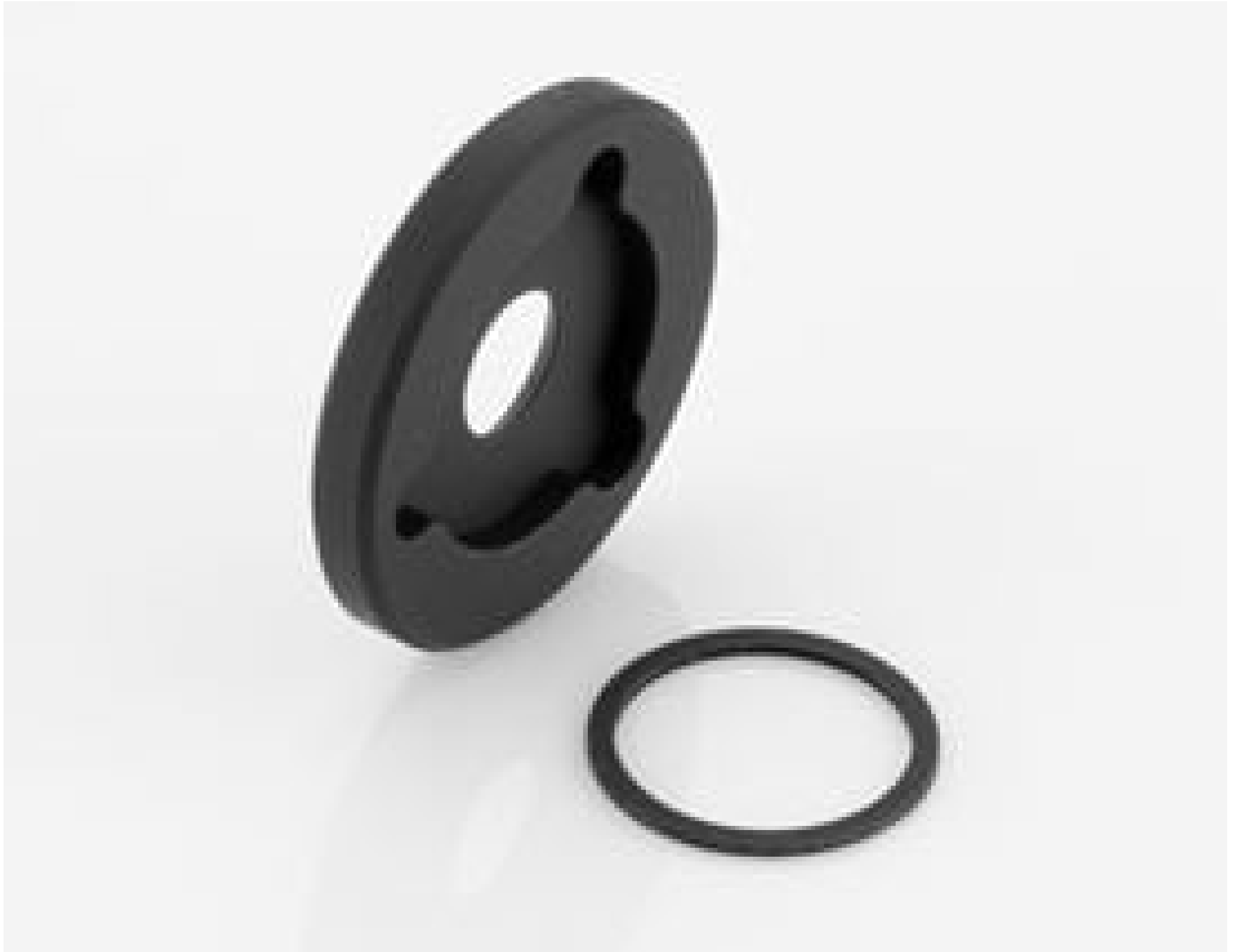
Filter Holder for Cx lens