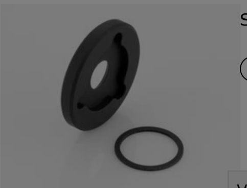
Filter Holder for Cx lens