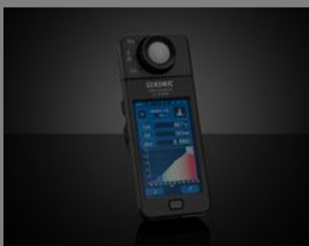
Testing and Detection