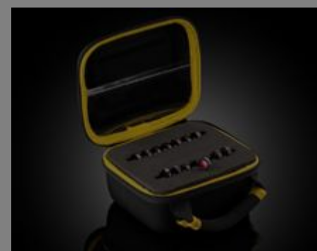
Hard Coated OD 4.0 Bandpass Filter Kits