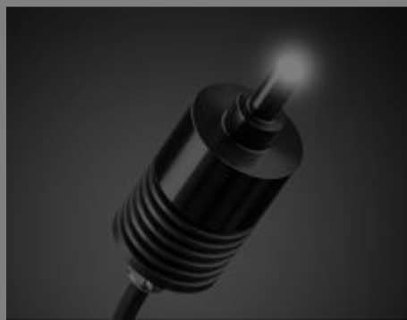
Advanced Illumination High Intensity In-Line Lights