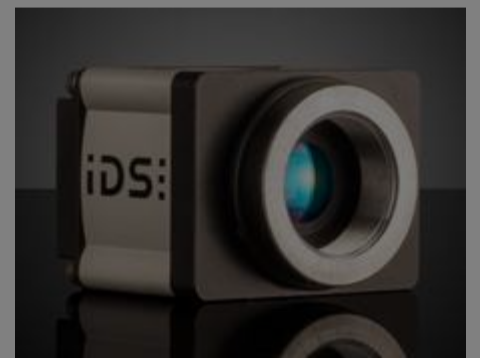
IDS Imaging uEye+ FA IP65/67 PoE Cameras