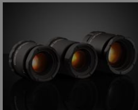
Cw Series Fixed Focal Length Lenses