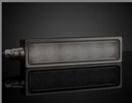
Advanced Illumination UltraSeal Washdown Bar Lights