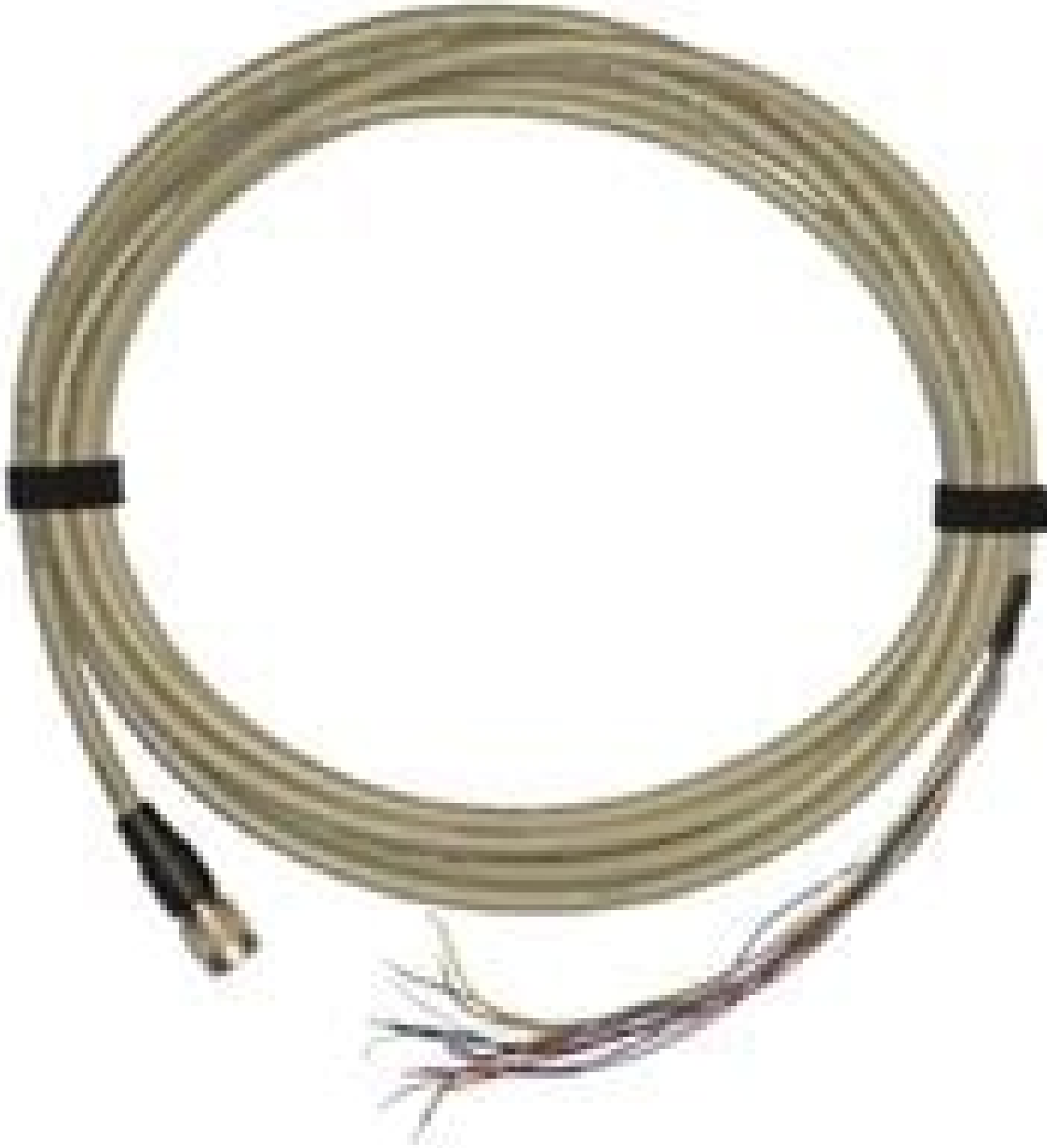
#59-736 Mako GigE, Guppy 5m I/O Breakout Cable