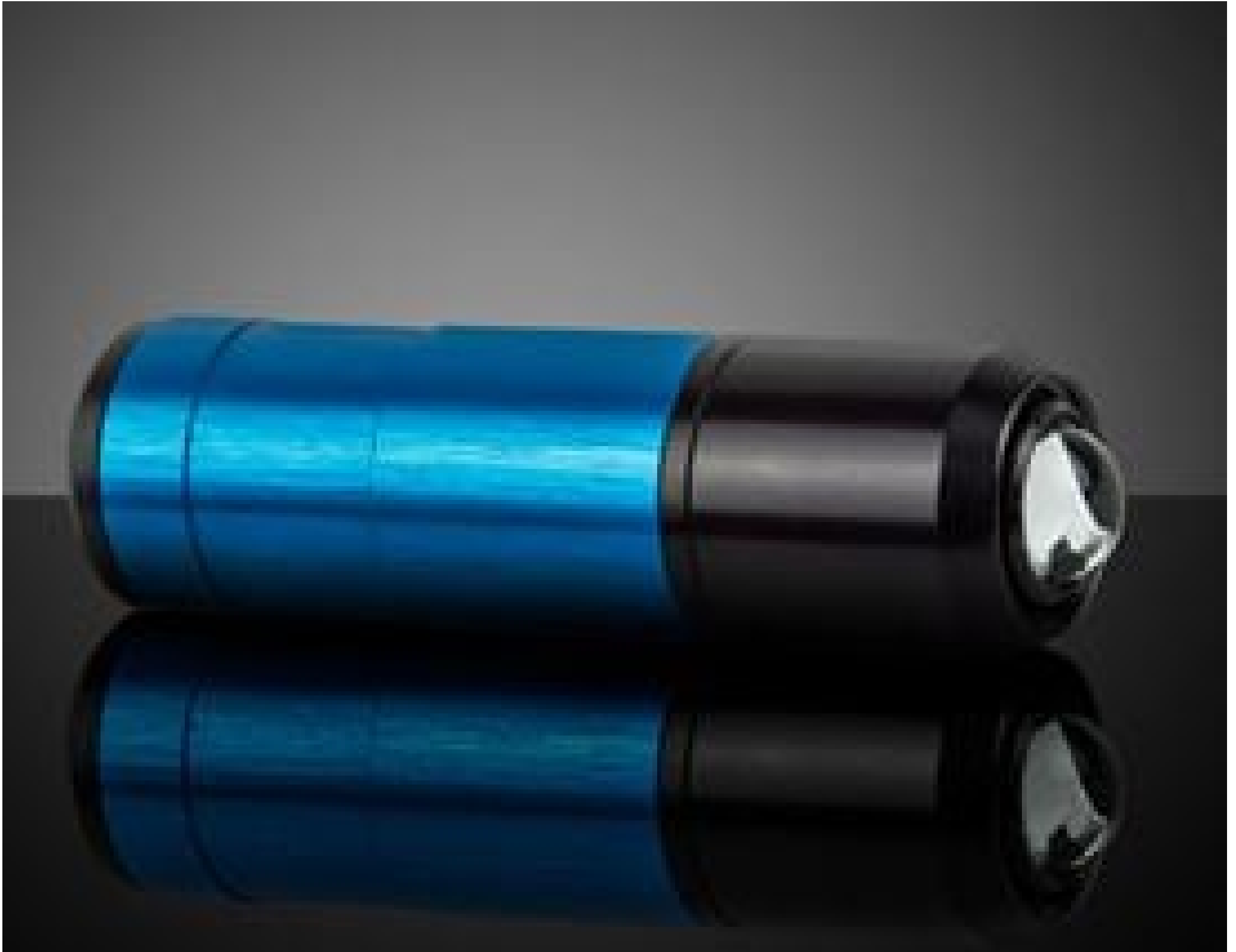
Premier Laser Diode Detector