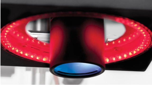
Hypercentric Lens in Borescope Mode