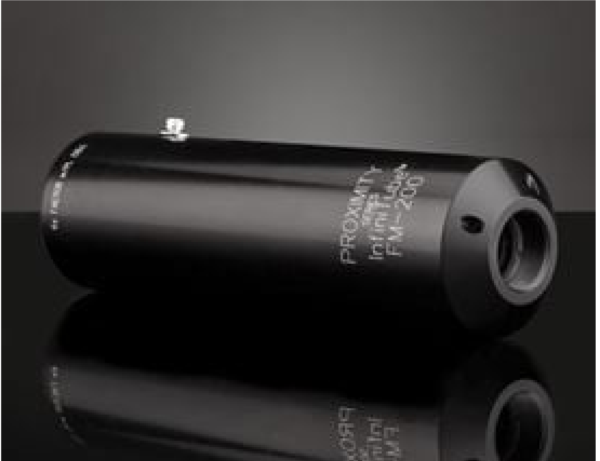
Infinitube FM-200 (1X), #58-310

See More by Infinity Photo-Optical Company