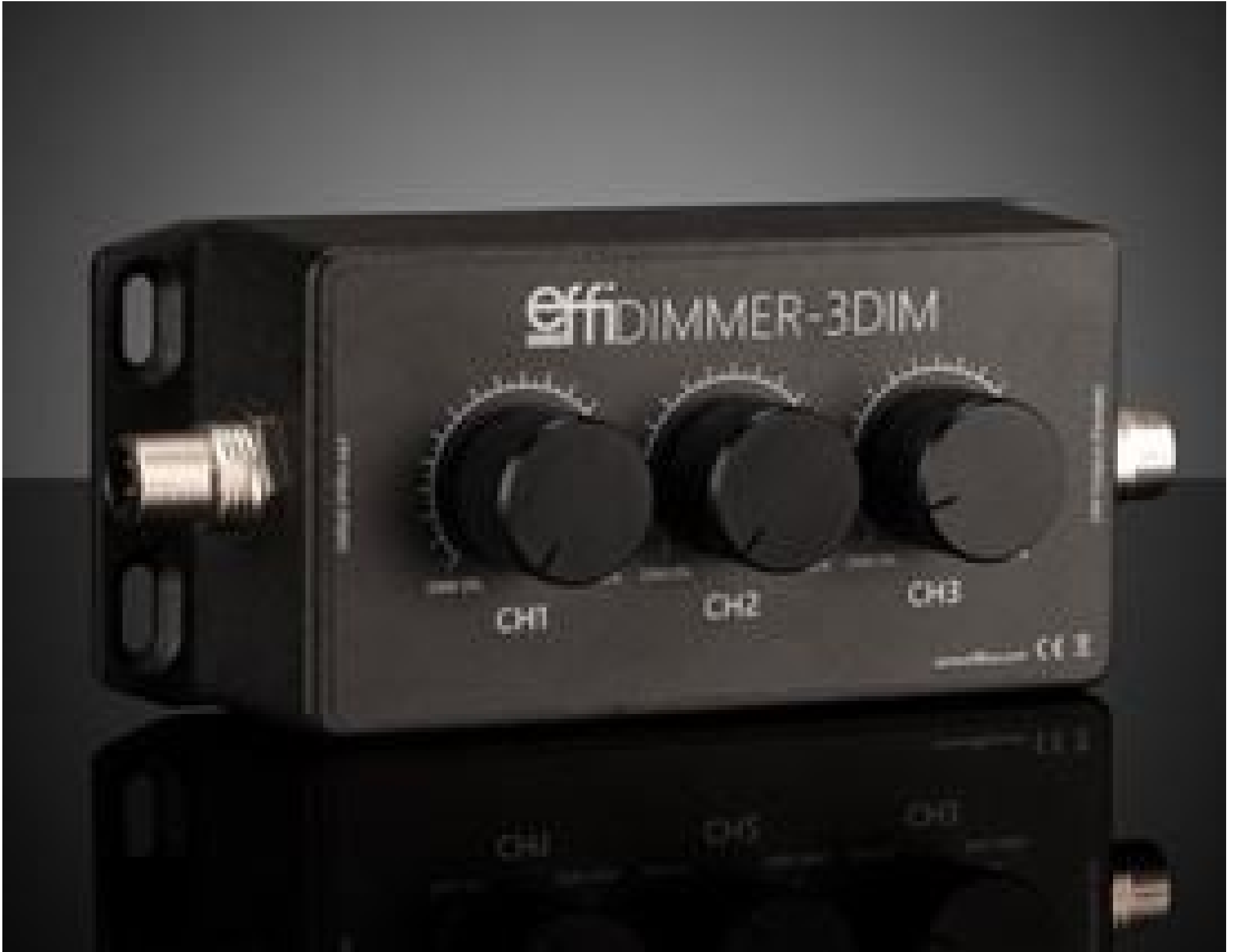
Intensity Adjustment Potentiometer for Effilux LED Lights