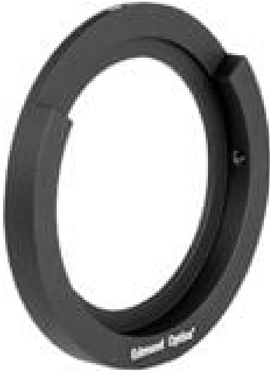
Iris Mount for 70mm Outer Diameter Irises, #53-921