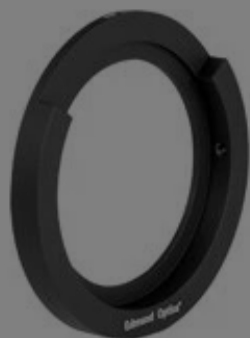
Iris Mount for 70mm Outer Diameter Iris Diaphragms #53-921

Please select your shipping country to view the most accurate inventory information, and to determine the correct Edmund Optics sales office for your order.