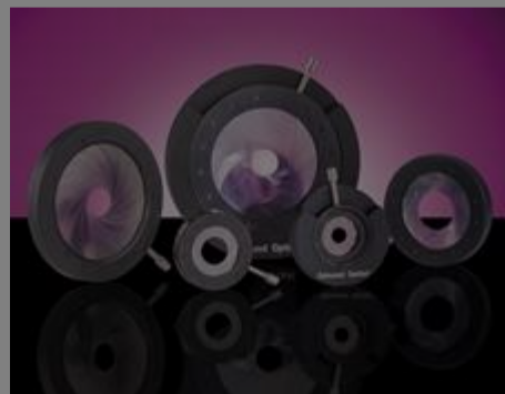
#53-913 - 50mm Max. Aperture, Stainless Steel Iris Diaphragm €189,00