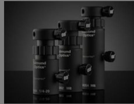
Adjustable Height Post Holders