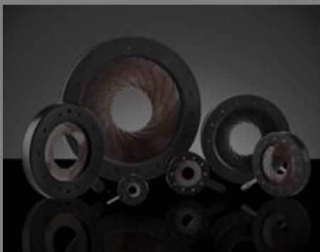
#32-617 - 50mm Max. Aperture, Iris Diaphragm €139,00