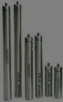
English Stainless Steel Mounting Posts