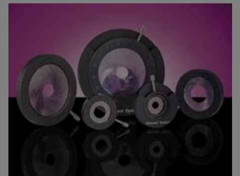
#53-910 - 12mm Maximum Aperture, Stainless Steel Iris Diaphragm €47,25