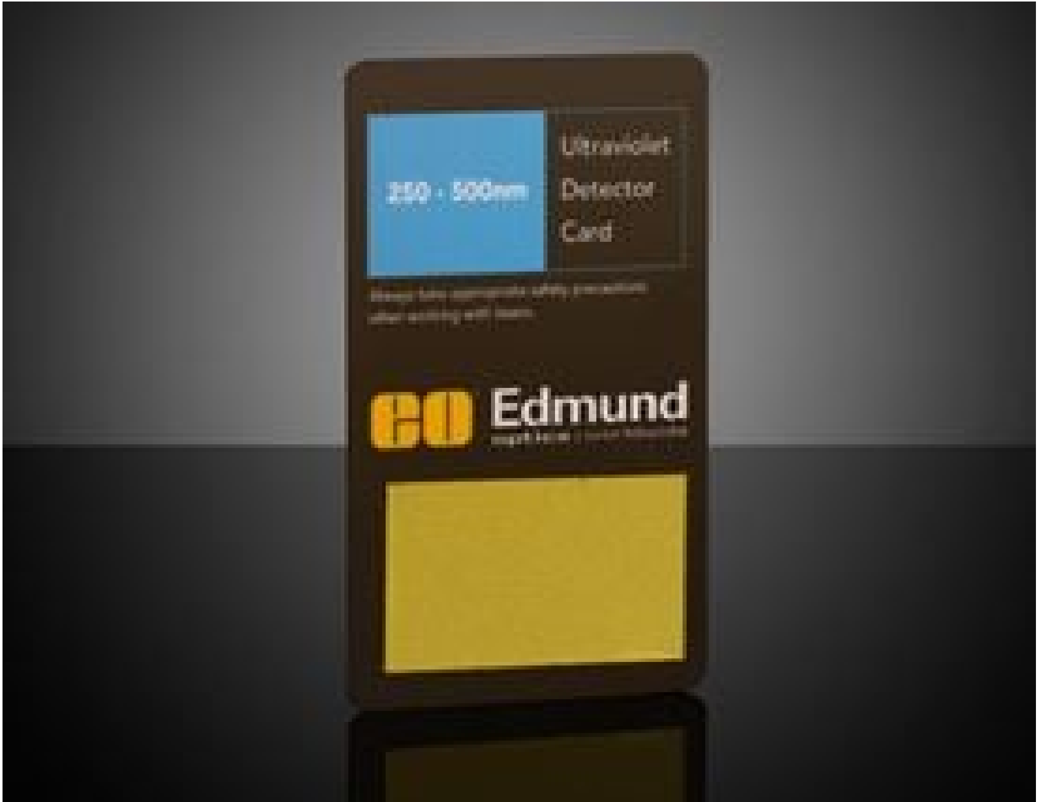
Laser Detection Card UV