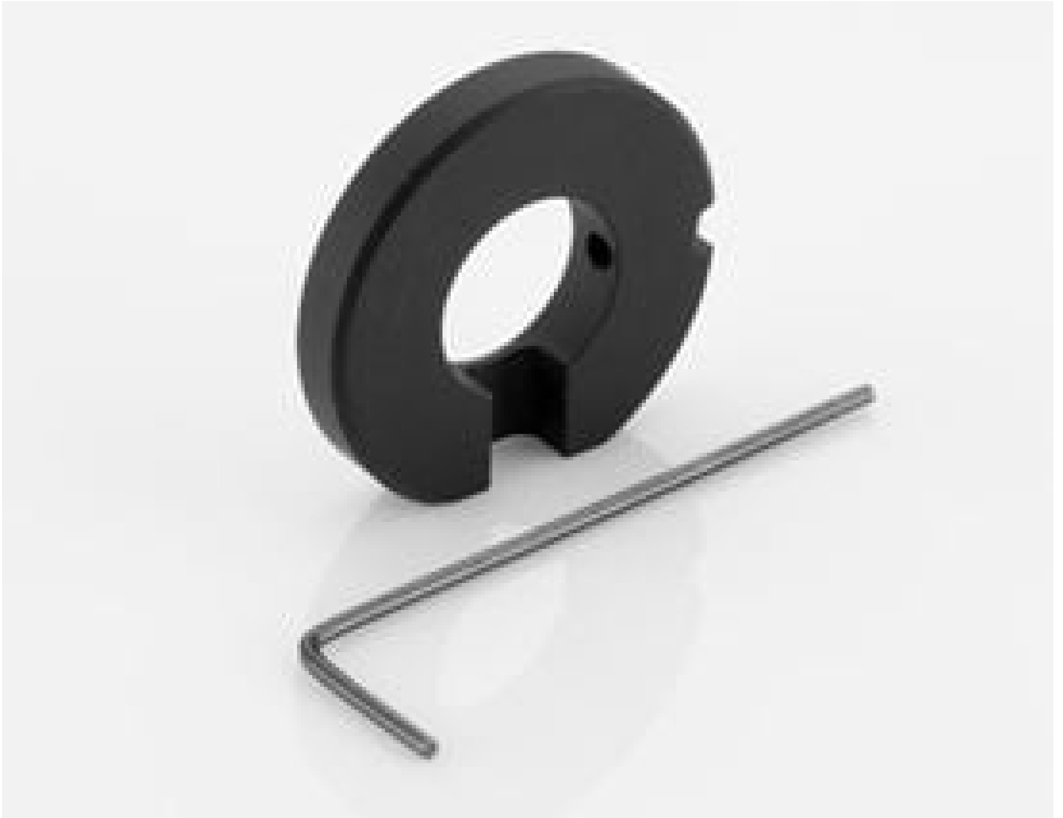
#33-660: Liquid Lens Holder for 25mm Cx Lens