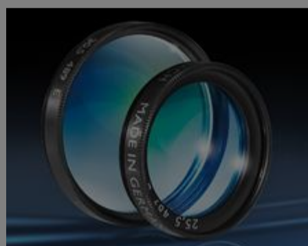
#49-814 - M62 x 0.75 Mounted UV/IR Cut-Off Filter €299,00