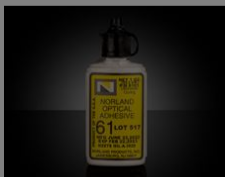
#37-322 - Norland Optical Adhesive NOA 61, 1 oz. Application Bottle €41,50