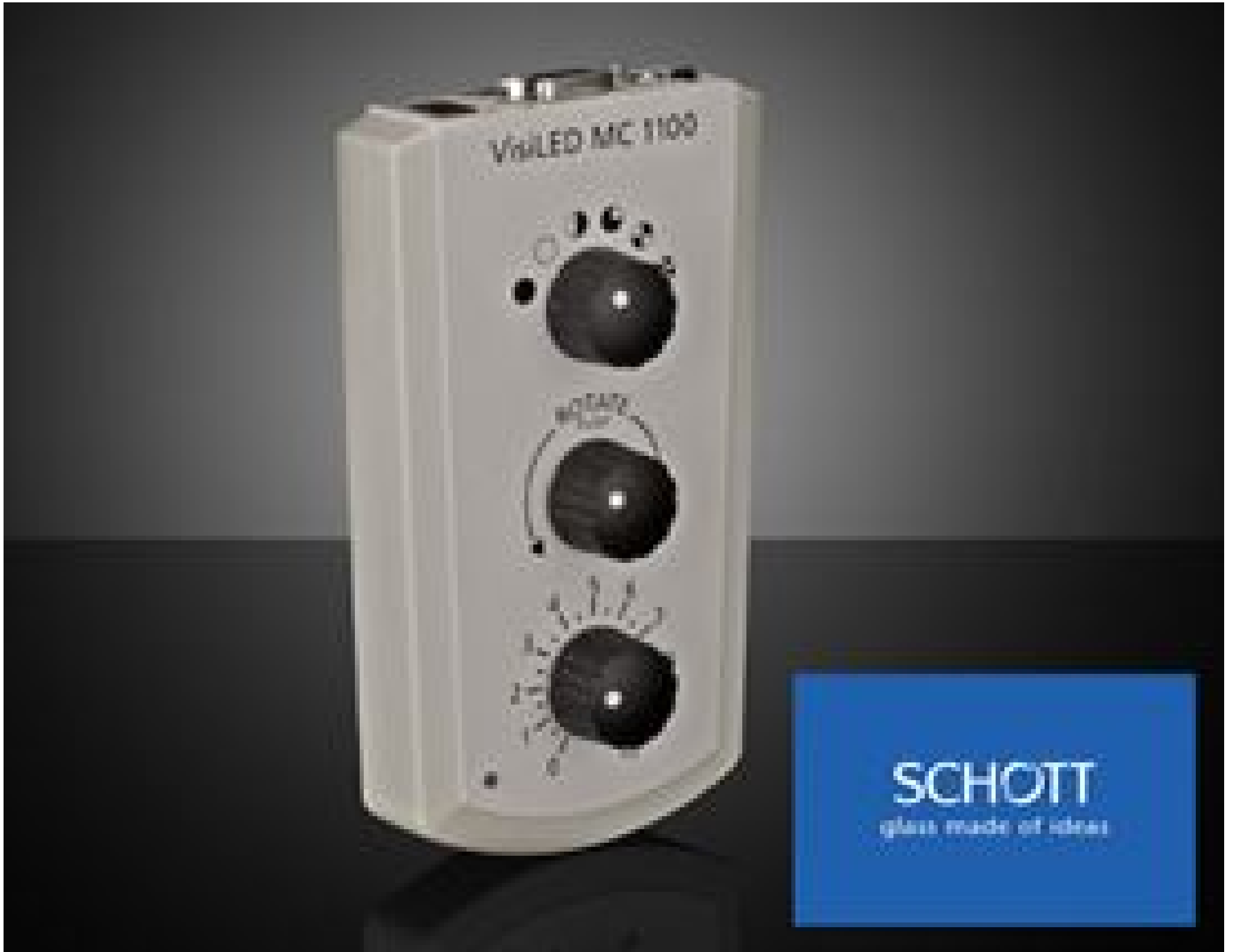
MC 1100, Multifunction Controller, #16-790