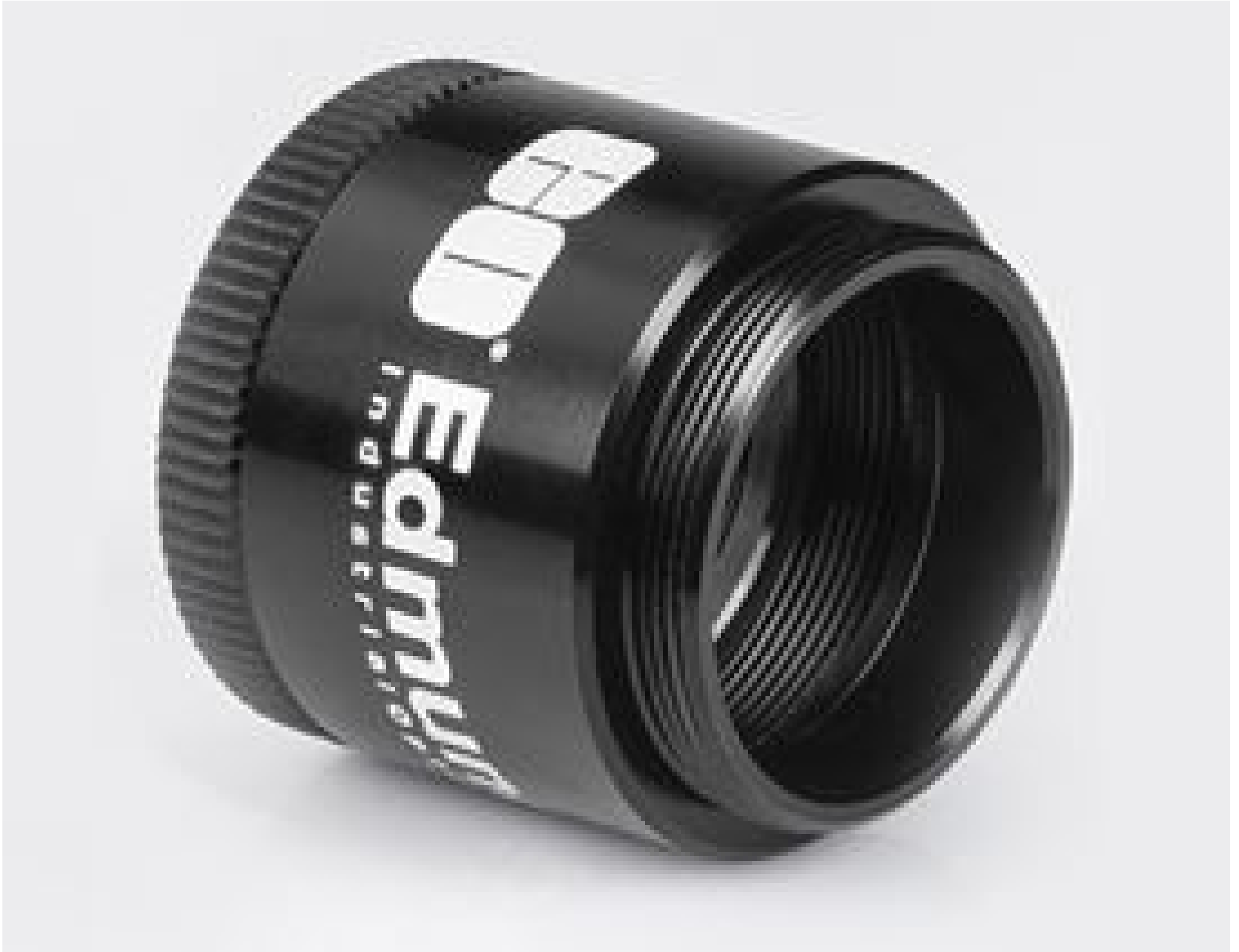
Mitutoyo Filter Holder, #56-993