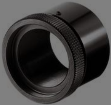
#03-625 - 30mm - 50mm Length, C-Mount Fine Focus Tube €118,00