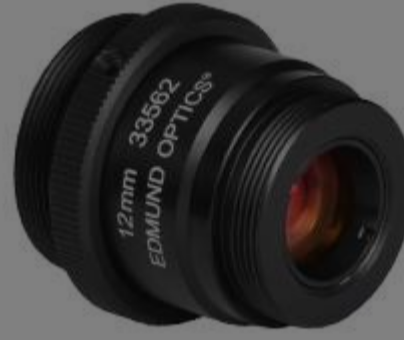
#33-562 - 12mm Cx Series Fixed Focal Length Lens €245,00