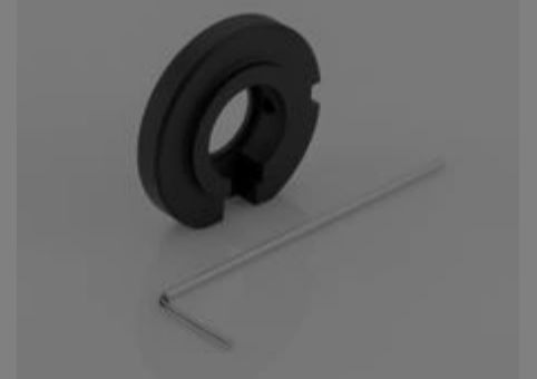
#33-645 - Liquid Lens Holder for 16mm Cx Lens €35,75