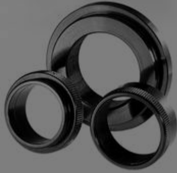
#03-629 - C-Mount Double Male Thread Ring €36,75