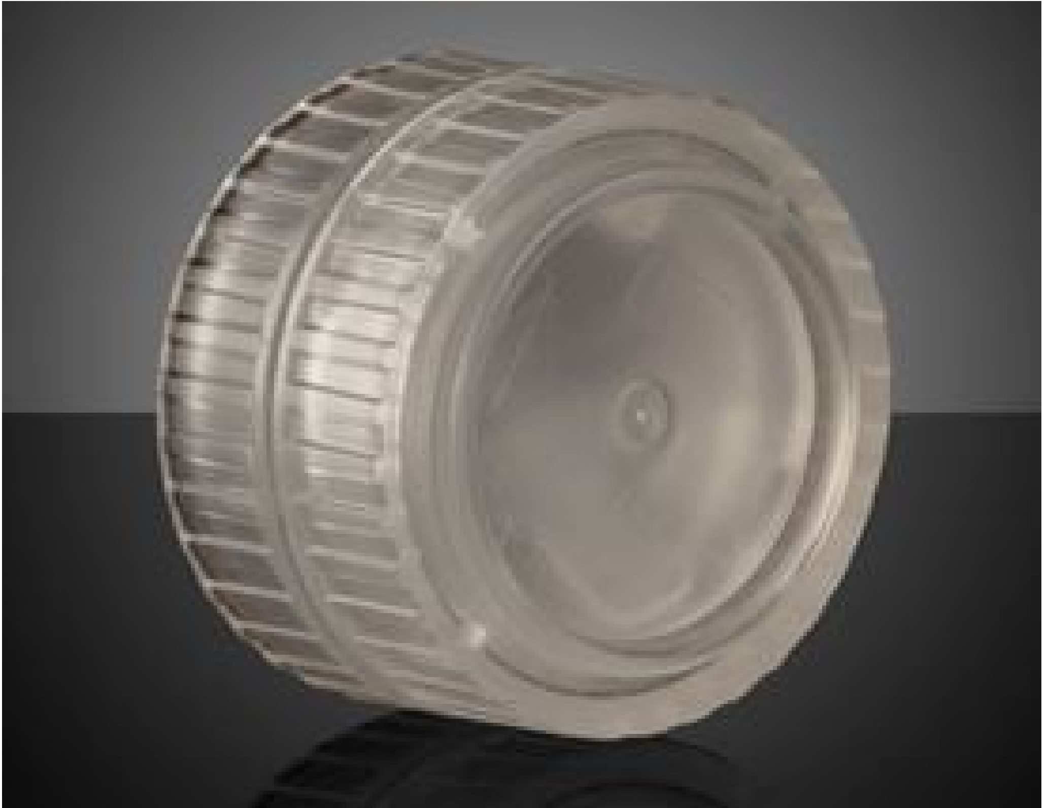
Non-Contact Impact Case for 12.7 Dia. x 6.35mm Thick Optics