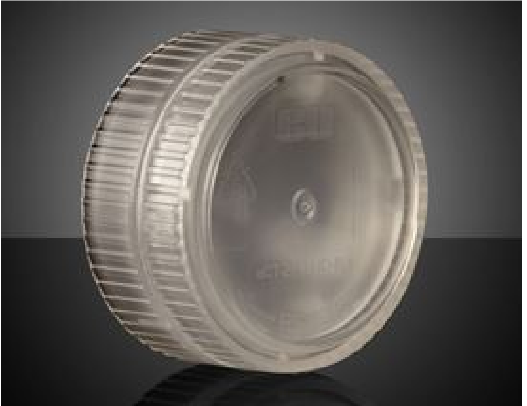
Non-Contact Impact Case for 25.4 Dia. Optics