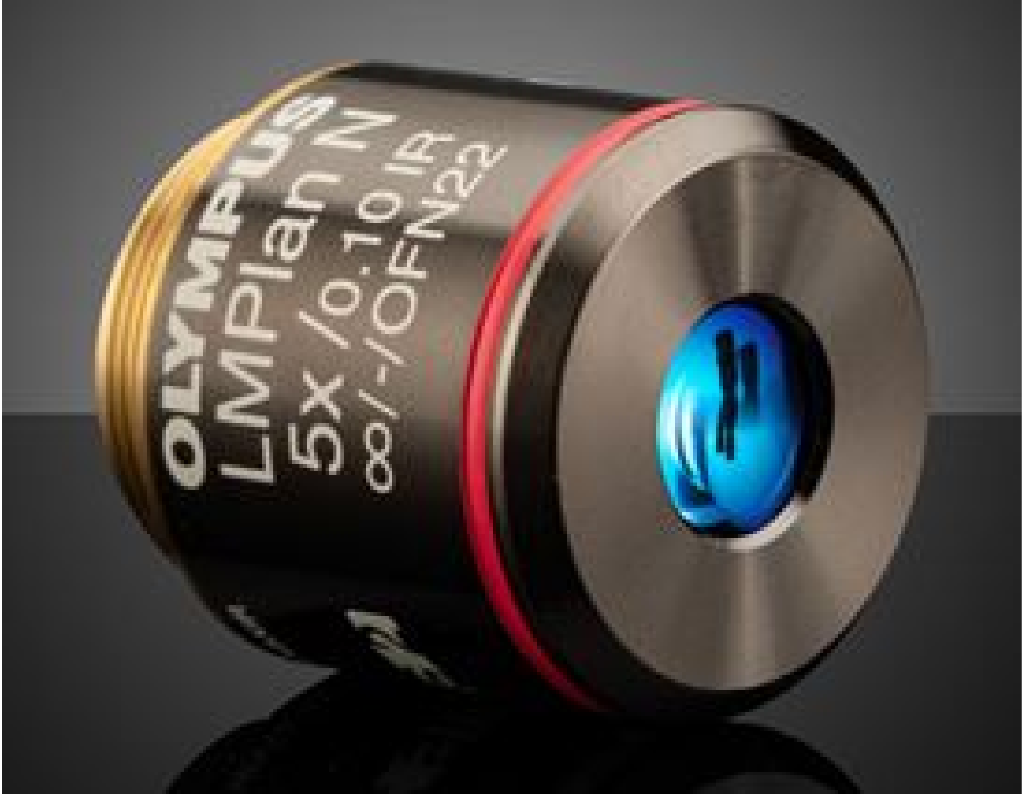
Olympus LMPLN5XIR 5X NIR Objective