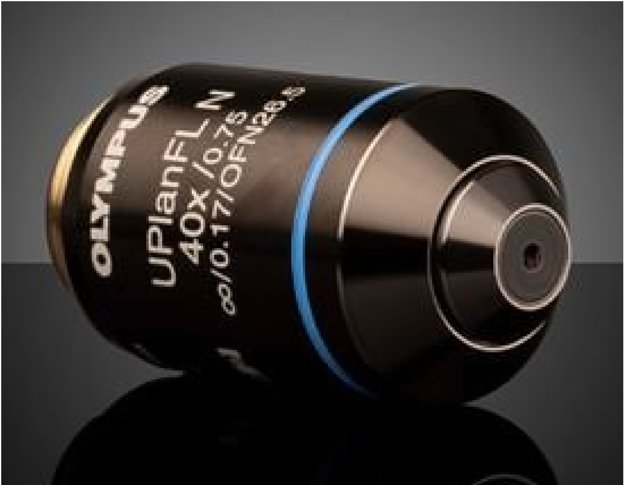
Olympus UPLFLN 40X Objective