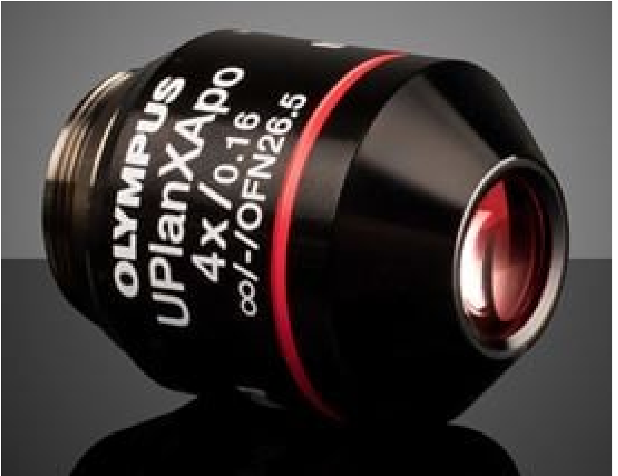
Olympus UPLXAPO 4X Objective, #14-905