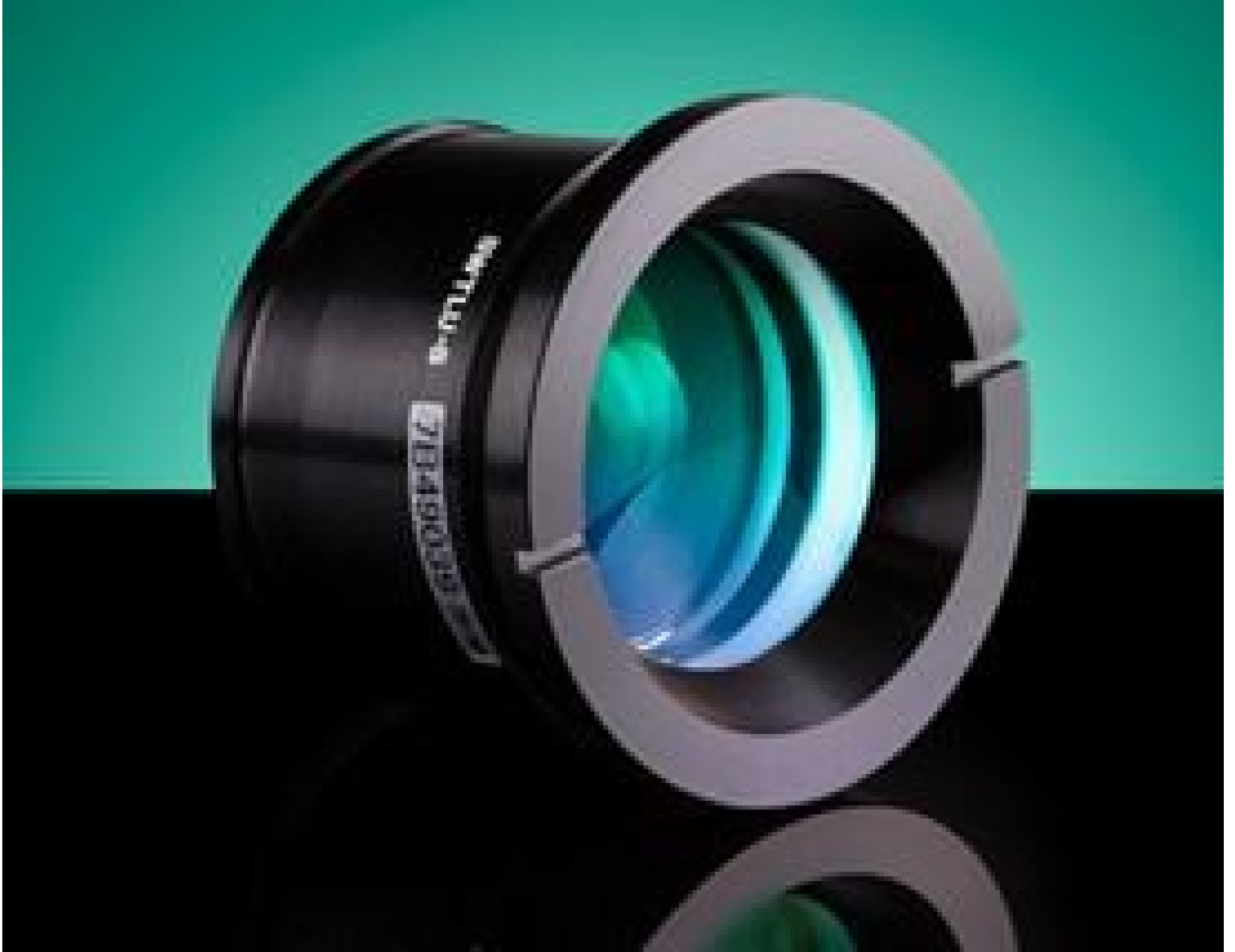
Olympus Wide Field Tube Lens, #36-401