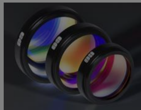
High Performance Mounted Machine Vision Filters