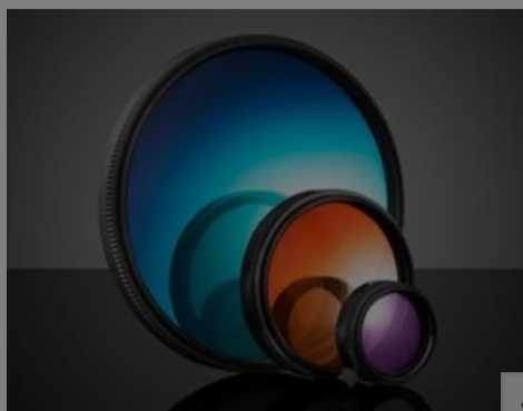
Mounted Machine Vision Filters

Please select your shipping country to view the most accurate inventory information, and to determine the correct Edmund Optics sales office for your order.