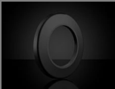
#33-308 - Filter Adapter M62 x 0.75 from M40 x 0.5 (Female) €40,50