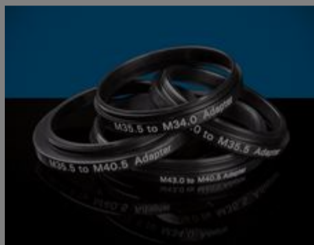
Machine Vision Filter Adapters