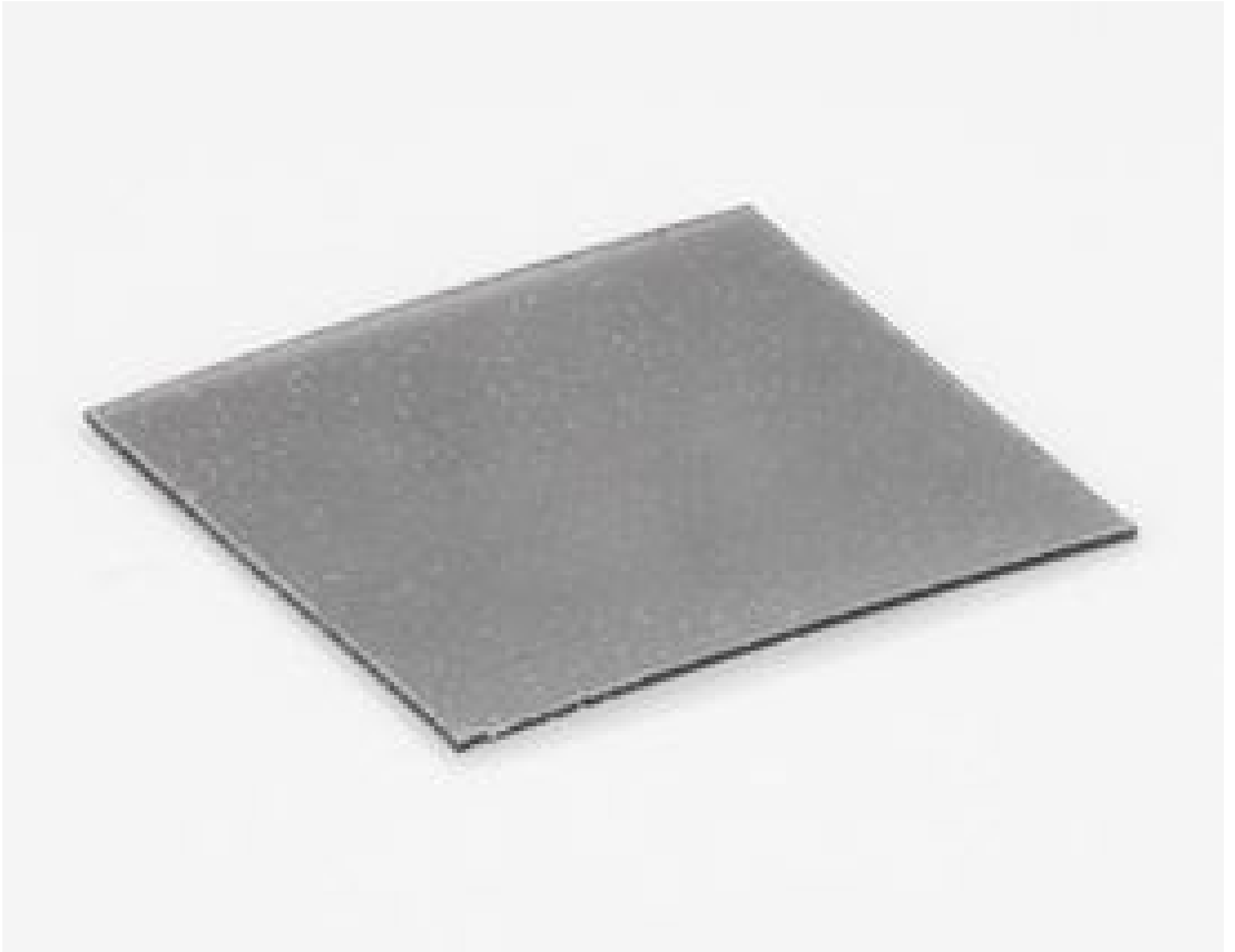
#34-881: Polarizer Accessory for 1 LED Bar Light