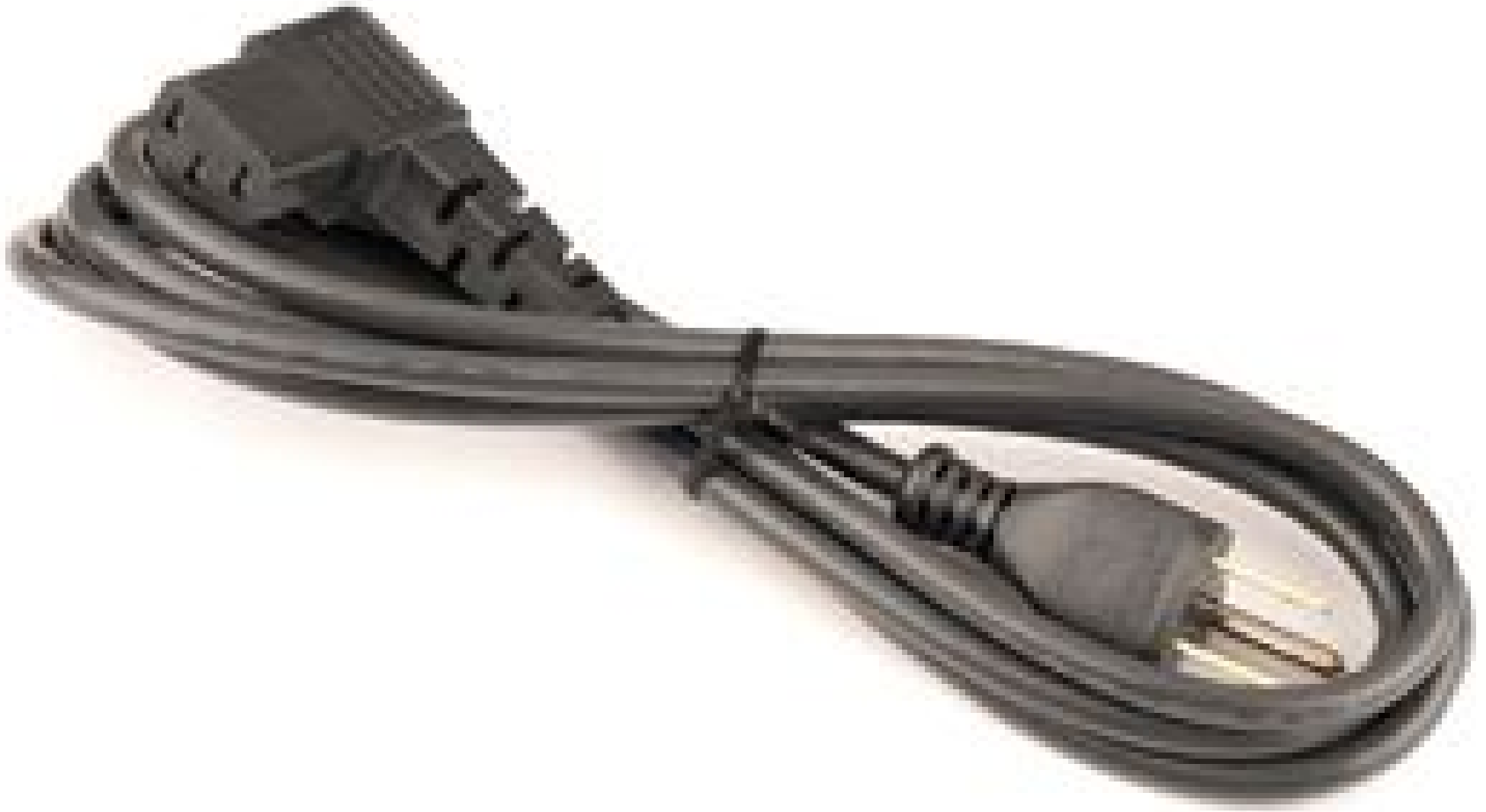
Power Cord for CX43 Microscope (USA) | Olympus UYCP-11