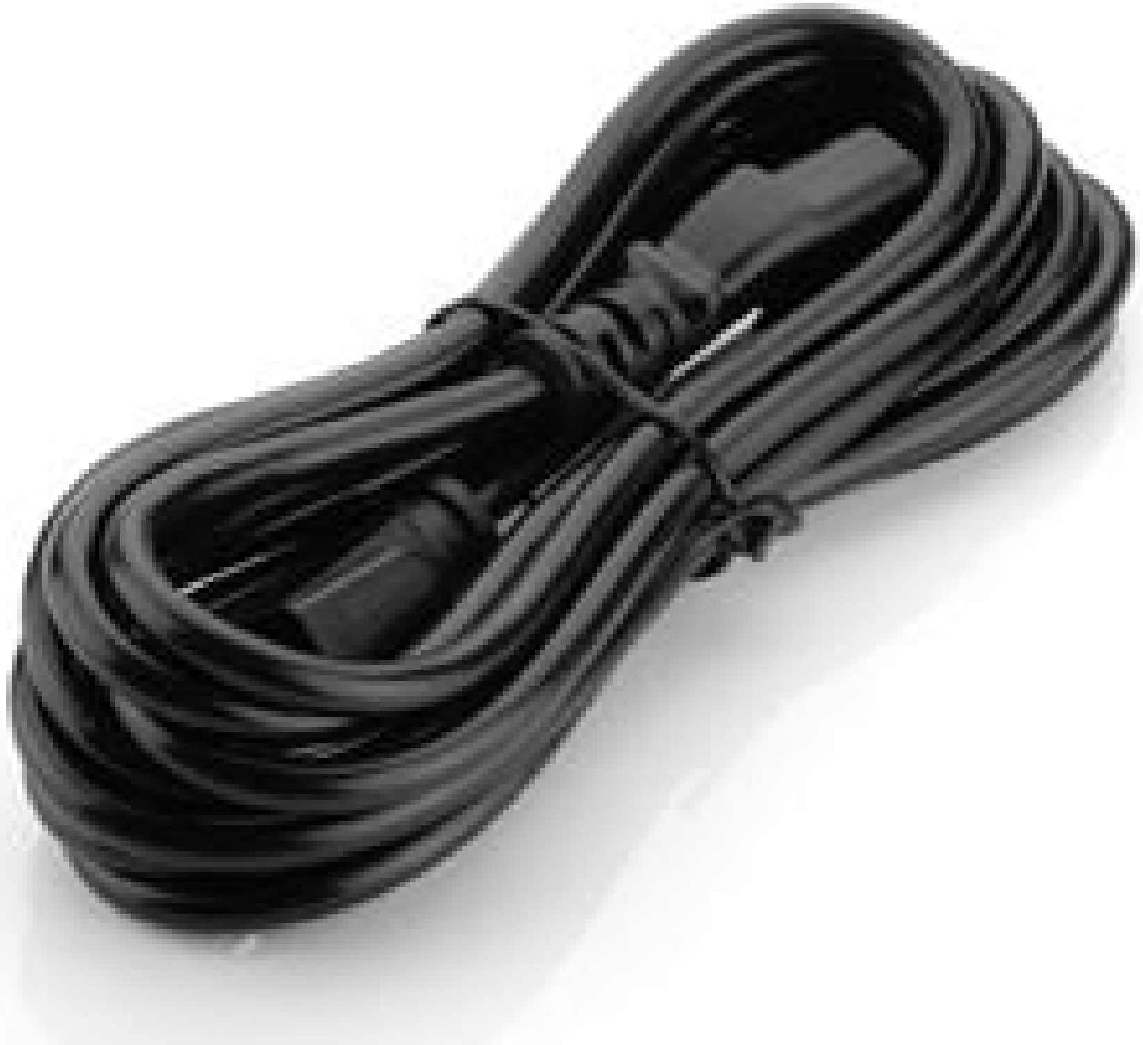
Power Cord for MFC-200 Power Supply (120V)