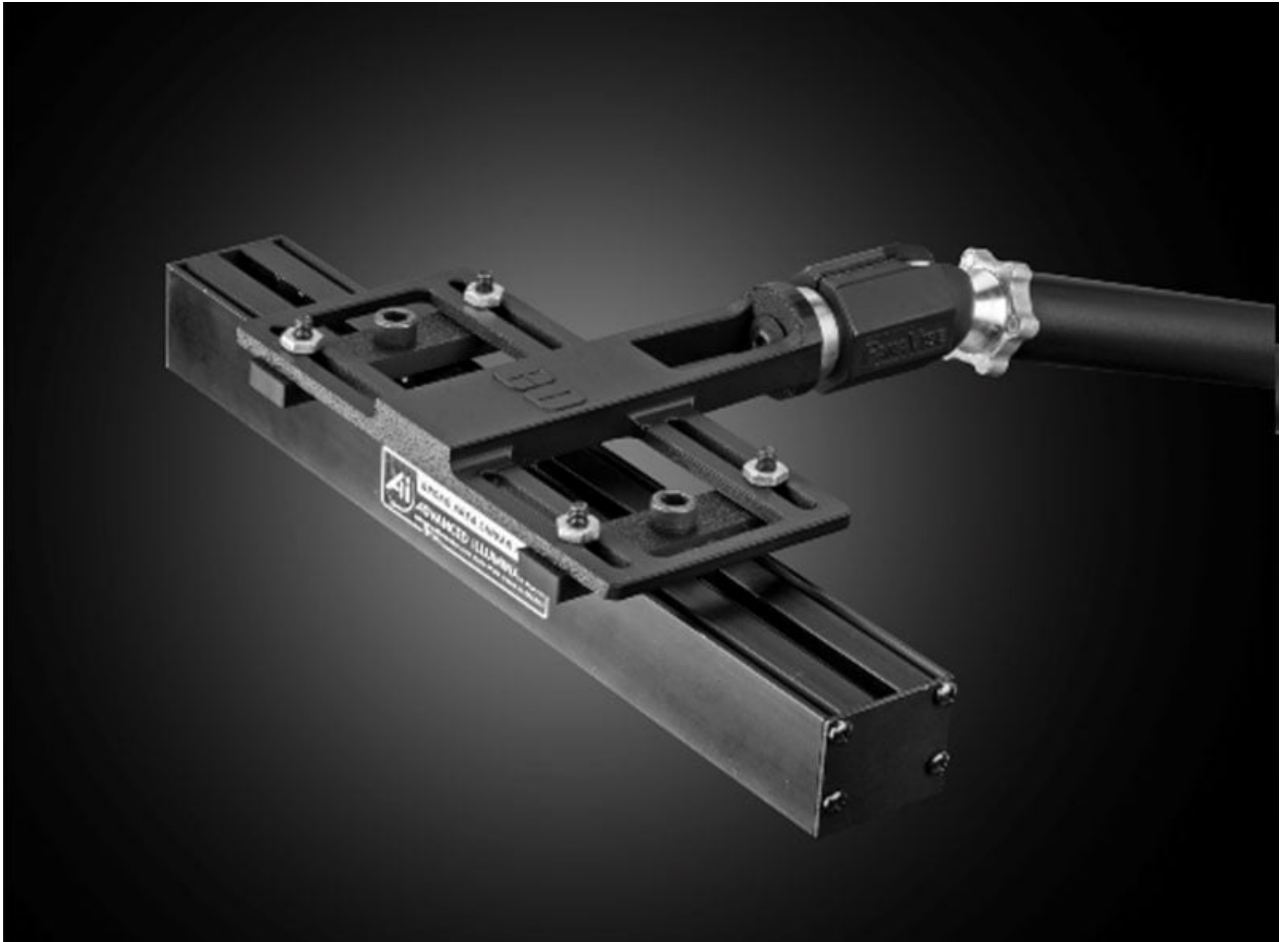
Bar or Line Light Configuration