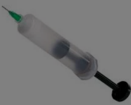
#55-044 - HandPlunger (3cc Barrel), Dispenser Units €37,25