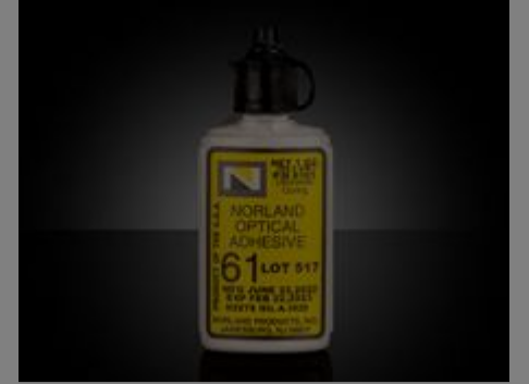
#37-322 - Norland Optical Adhesive NOA 61, 1 oz. Application Bottle €41,50