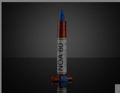
3cc Dispensing Barrel for NOA (NOA 60 shown as an example)