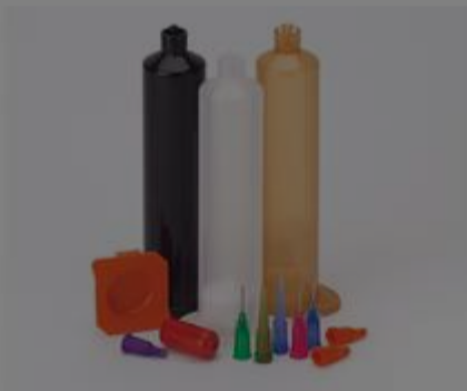
Dispenser Barrels and Accessories