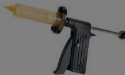
Dispensing Guns and Hand Plungers