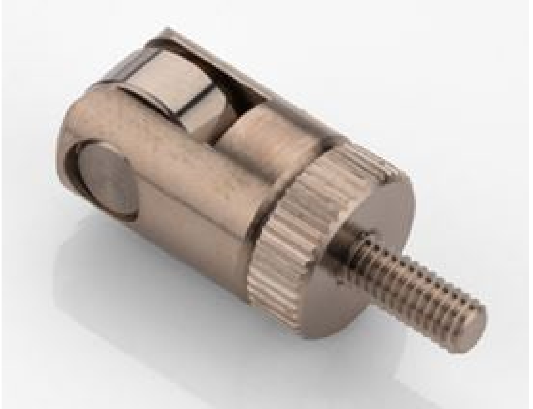
Roller Attachment Measuring Probe