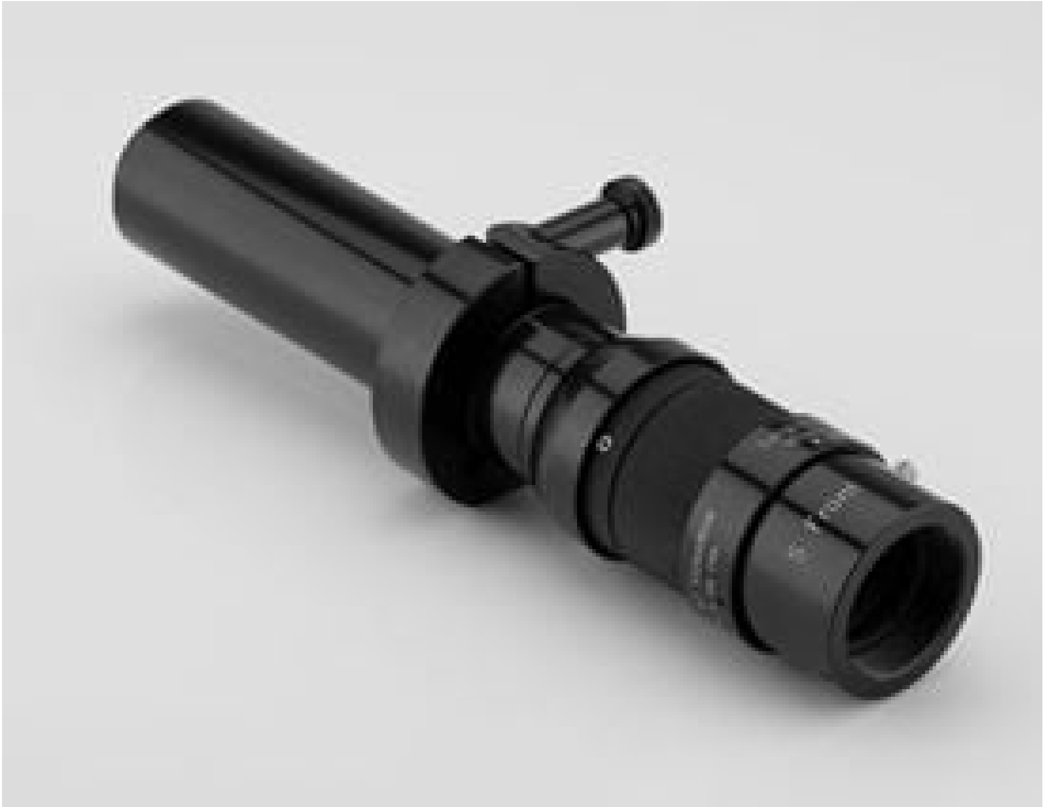
#86-889: S Main Body, C-Mount, KC VideoMax