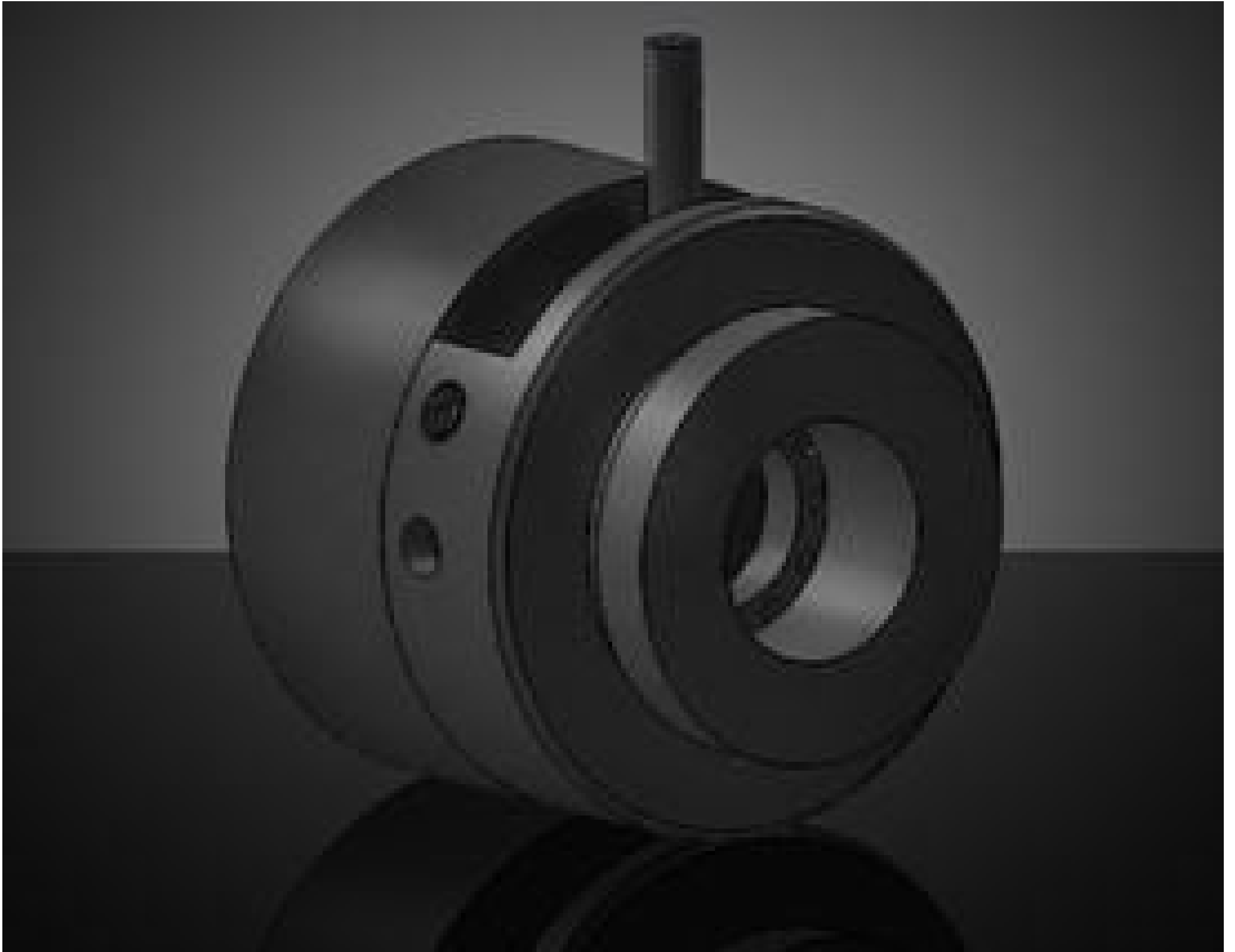
TECHSPEC® S-Mount Iris Diaphragm Barrel