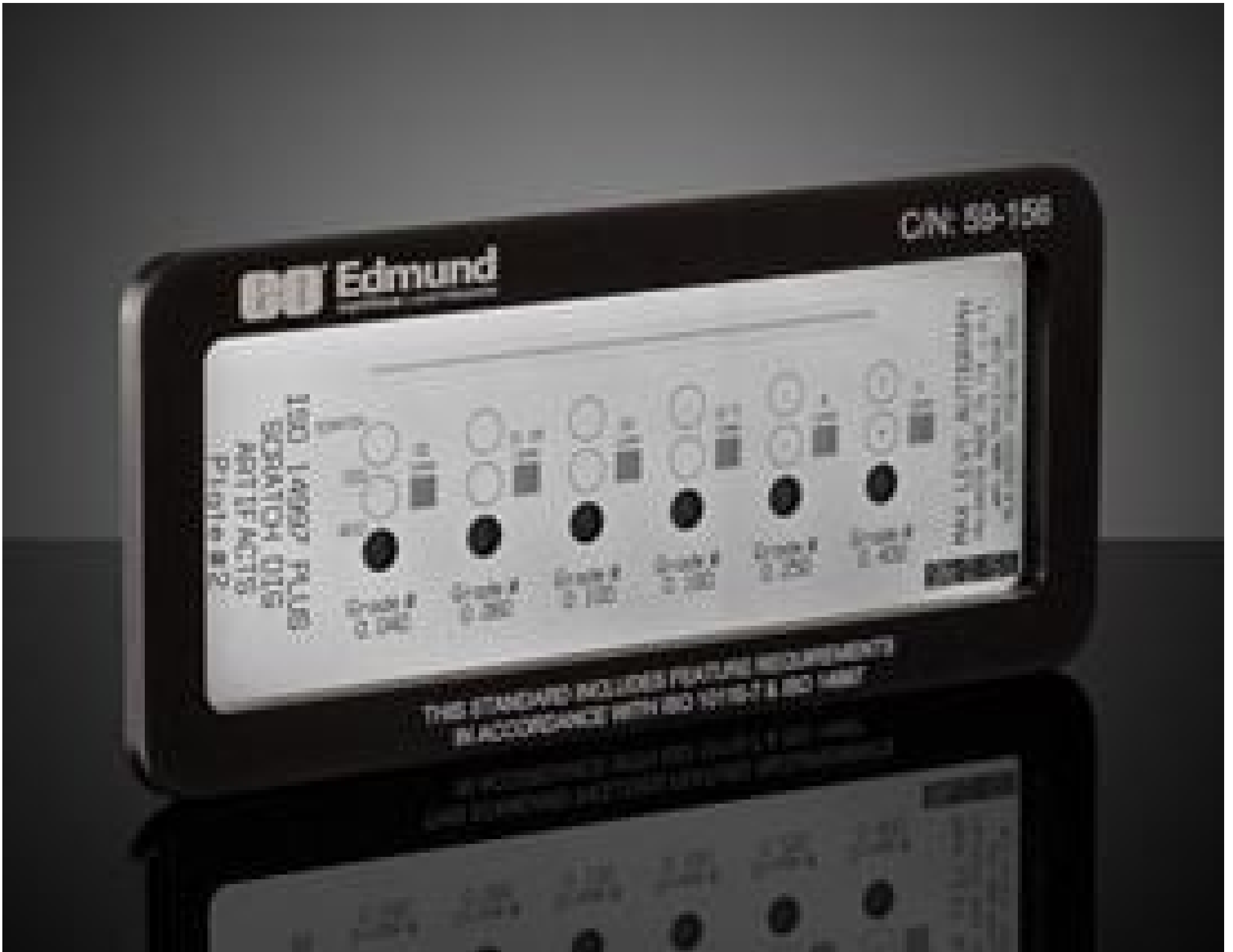
Scratch & Dig Target (1st Surface Negative), #59-156